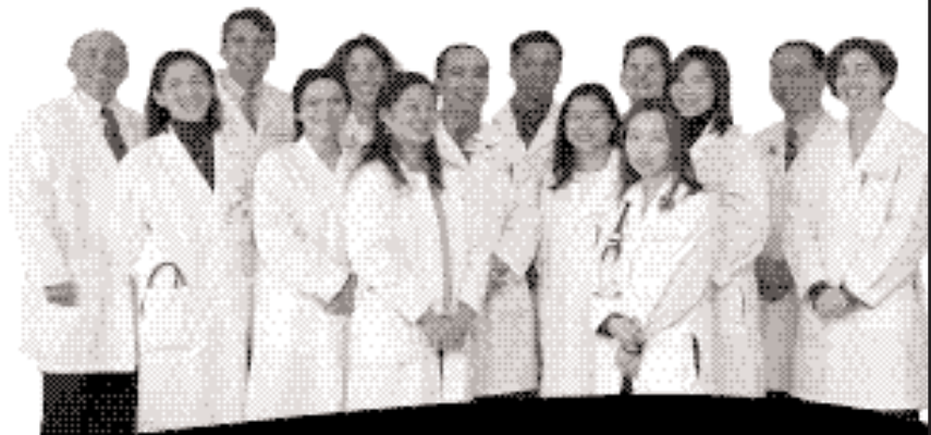
Medical Staff of the Redwood Shores Health Center

Contact us at (650) 598-3160 or visit our Web site at www.pamf.org