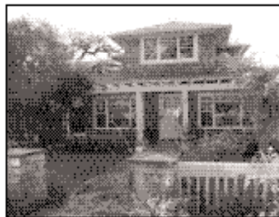
Sale Pending 6 Perry Avenue, Menlo Park 4 Bedrooms/3 Baths $1,995,000