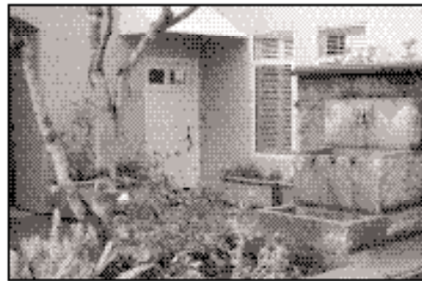
Downtown Palo Alto Luxury 233 Homer Avenue, Palo Alto 2 Bedrooms/2.5 Baths $1,395,000

For a more personalized evaluation of your property or any information regarding the current real estate market, contact Pooneh today!