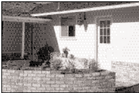
San Mateo Bordering Belmont 350 W. 41st Avenue, San Mateo 3 Bedrooms/2 Baths $1,079,000