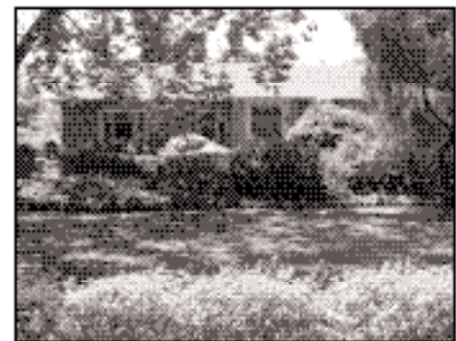
Prime Crescent Park Location 1250 University Avenue, Palo Alto 3 Bedrooms/3 Baths $2,195,000