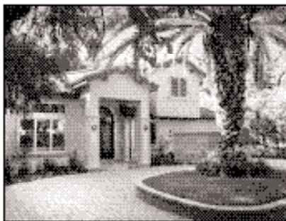
Old World Charm 523 Encina Avenue, Menlo Park 6 Bedrooms/4.5 Baths $2,350,000