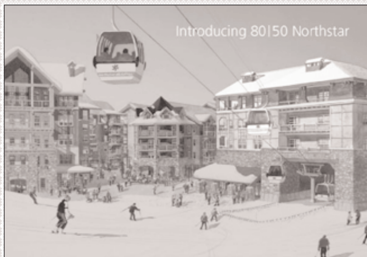
Introducing 80150 Northstar

80150 Northstar Lake Tahoe Live the High Life at a Fraction of the Price