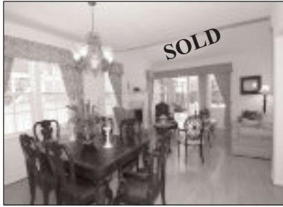
70 WATERSIDE CIRCLE, REDWOOD SHORES

This wonderful home in Sandpiper Lagoon is truly in "Model Condition" 4 spacious bedrooms. 2.5 Baths, Family Room, eat-in kitchen and a 2 car garage. Sparkling and easy to maintain wood floors on the ground level and neutral color berber carpet upstairs add to the warmth and pizzazz. Master bath shower and floor have been recently upgraded w/Brazilian tile. Kitchen appliances are new and the latest in brushed stainless. Recessed lighting and new wall plates, some on dimmers. Custom built-in maple wood office furniture in one bedroom is suited for any executive. Custom window treatment throughout. Kid friendly community. Offered at $959,000