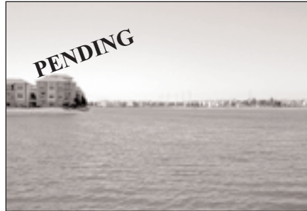
100 BALTIC CIRCLE, REDWOOD SHORES

Spectacular! Unobstructed! Never-ending! Romantic! widest of wide water views from every room. This 2 master bedroom + loft, 3 full baths, 2 car garage pent house is amazing. Sky-high windows and ceilings, fireplace in living room, open floor-plan is perfect for entertaining. Sweeping 90 degree views expanding from the east bay to the south bay and absorbing all the natural sun light in between. Tasteful décor includes: granite kitchen counters, light colored carpets, top of the line appliances. Entire unit is in like-new condition. Offered at $689,000.