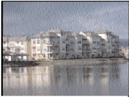
SPECTACULAR WATER & MOUNTAIN VIEWS!!! Sunny, spacious 3 BR + den/2.5 BA in Ventana del Mar!