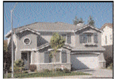
LUXURY HOME FOR LEASE!!! 4 bedrooms, 3 baths on a cul de sac. Granite kitchen counters, marble floors and baths. Available now..