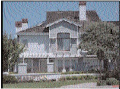
WONDERFUL CORNER TOWNHOUSE at Hampton!!! 3 bedrooms, 2.5 baths. Marble & maple hardwood. Large patio.

RE/MAX California Top 10 RE/MAX USA Top 20 SAMCAR Top 20