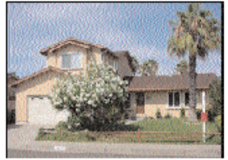
A PARK IN YOUR BACKYARD!!! New addition & total remodel. Water views. 5 BR, 3 BA. Granite in kitchen, quality appliances. No HOA dues!