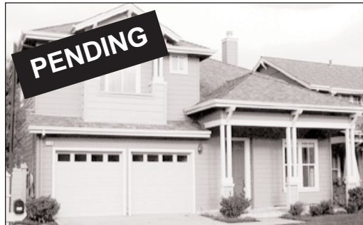
2116 Gossamer Redwood Shores Rockport Model w/loft, 4br+loft, 3 ba $989,000

Please call Anna Ow for a Free Comparative Analysis on your property. Interest rate is low, now is a good time to sell! - All 3 listings sold with multiple offers !!!!