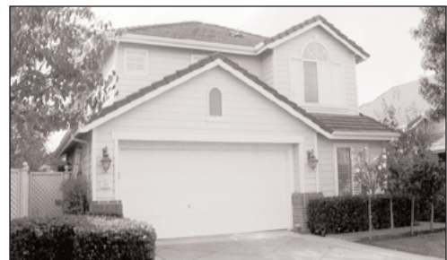
NEW LISTING 350 St. Martin Dr. RWS Waterfront rental in Gossamer Cove 5/3/2