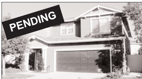
107 Moonbeam Lane, RWS $733,000 Gossamer Hollow's 3br/2.5ba in quiet lane