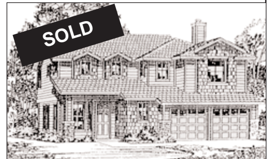
Gossamer Cove-410 Promenade Lane, RWS Freeport model 3 br,2.5ba Sold or $873,000